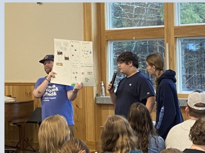
Confirmation Retreat at Camp Calumet