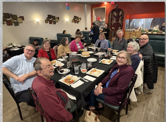
Eat Out After Church—Time Travel Cuisine